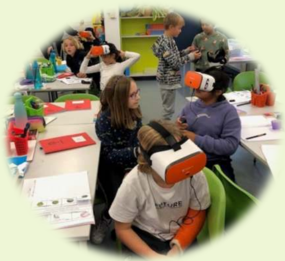
They use the VR headsets to explore the life cycle of a frog in Science