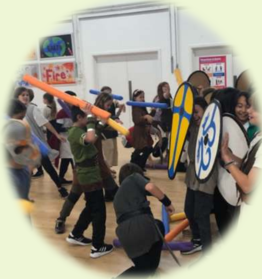
Year 5 had an Anglo-Saxon day