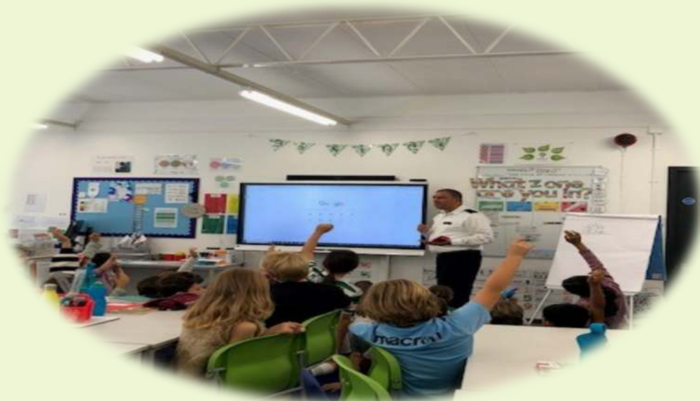
We read the London Eye Mystery in Autumn 1, which is all about a boy, Salim, who goes up on the London Eye but doesn't come down... we had a visit from a local policeman who was helping us to solve the case!